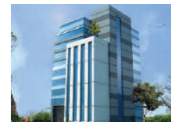
PLOT No. 7, SECTOR 125 NOIDA