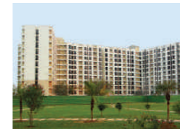
H20-RESIDENCY, GR. NOIDA WEST