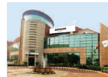
A-28, MATHURA ROAD