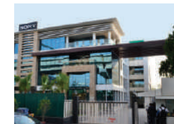
A-18, MATHURA ROAD