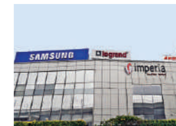
A-25, MATHURA ROAD