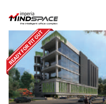
SECTOR 62, GOLF COURSE EXTENSION ROAD, GURGAON