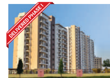
SECTOR 37C, GURGAON DWARKA EXPRESSWAY