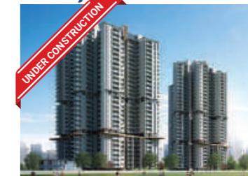
JAYPEE SPORTS CITY, YAMUNA EXPRESSWAY, GREATER NOIDA