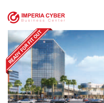
KNOWLEDGE PARK V, GREATER NOIDA WEST