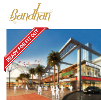
KNOWLEDGE PARK V, GREATER NOIDA WEST